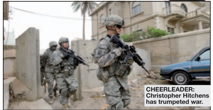
CHEERLEADER: Christopher Hitchens has trumpeted war.

Where Satan's Mistress goes wrong is that he believes the person who can get the audience to laugh at his oppo-